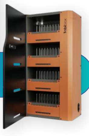
Secured via 4-diait code lock